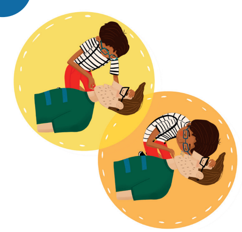
Look, listen and feel for breathing for no more than 10 seconds